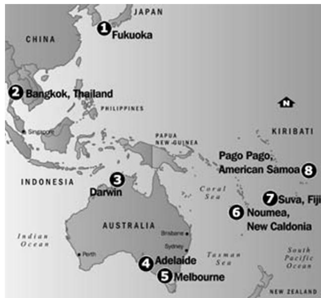
Location numbers show sequence of President Hinckley's

"It has been a very long journey," said President Hinckley, the first Church president to visit the island. "But it is worth it to look into your happy faces."