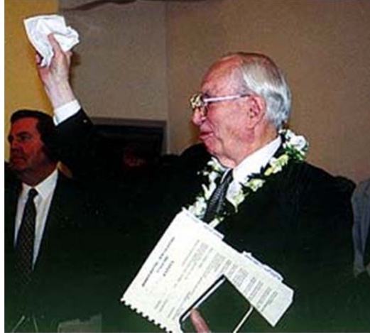
President Hinckley waves goodbye to members in Noumea, New Caledonia.

Before the meeting, President Hinckley's party was met by the governor, Tauese Sunia, his wife, and other legislative and judicial representatives. They were also greeted warmly by members, who draped them with beautiful leis.